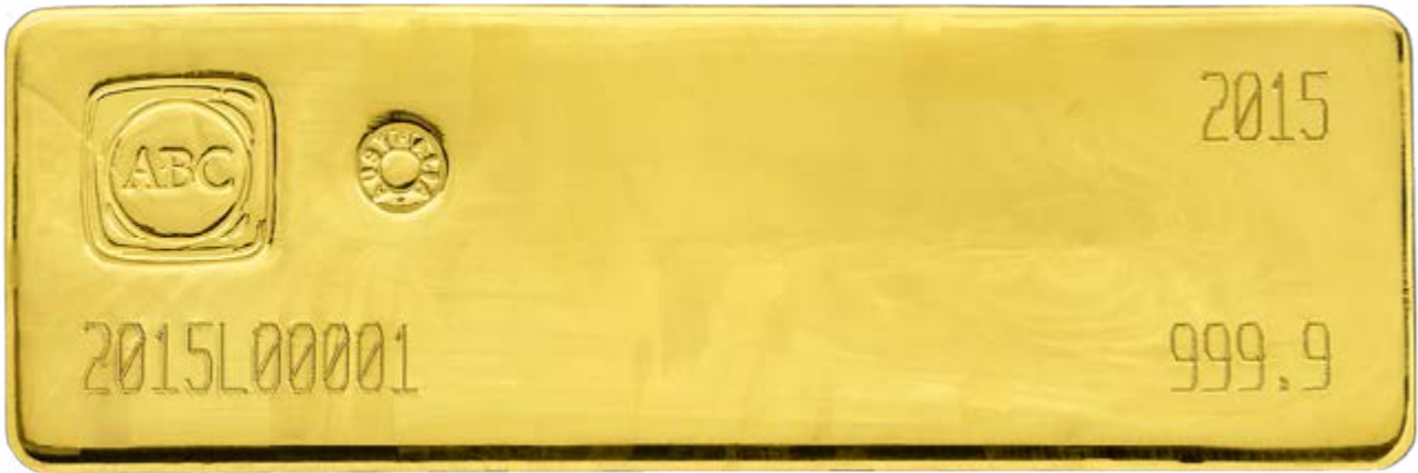
400oz ABC BULLION CAST BAR GOLD