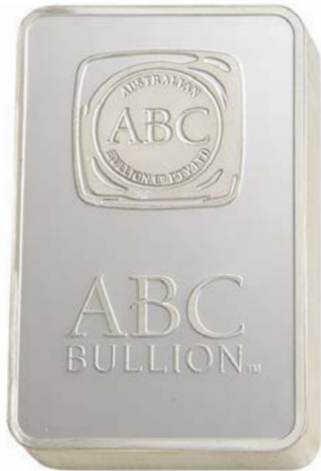
500g ABC MINTED BAR SILVER

Purity 999.5+ Origin Australia Length 86mm Width 55mm Thickness 11mm Net weight 500g