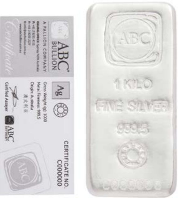
1kg ABC CAST BAR SILVER